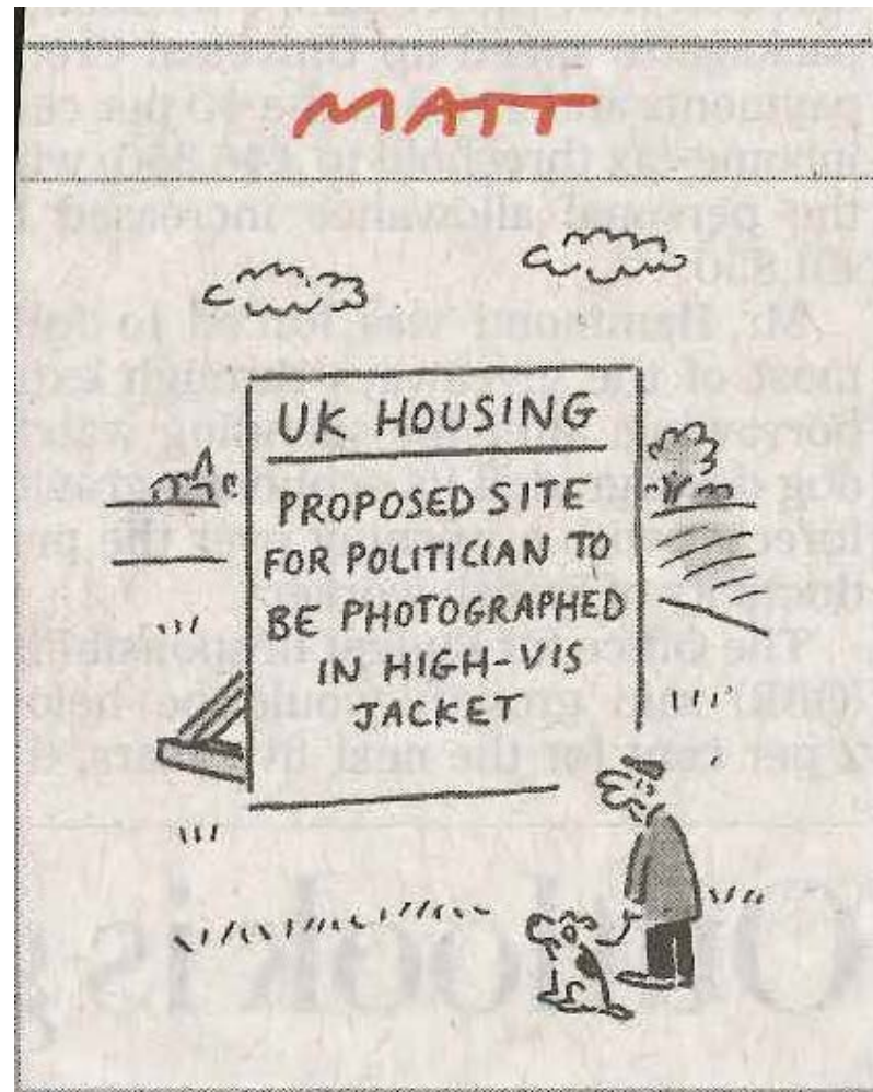
The Daily Telegraph, Thursday 23 rd November 2017